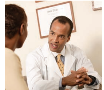
Genetic counselors and physicians work together to make a difference.