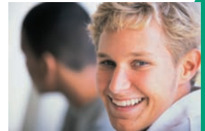
Take advantage of unique opportunities.

There are a variety of career settings that serve many different people. You could focus on cancer screening at a private practice. Or maybe you would prefer to counsel expectant parents at a community clinic. New and different opportunities regularly become available. Choose a path or create your own.