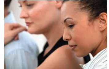
Add a different face to genetic counseling.

Consulting with a genetic counselor is an intensely personal experience. It demands a special bond of trust and understanding – the kind of bond that comes from belonging to the same community. Unfortunately, only 3 percent of genetic counselors in the United States are African-American or Hispanic. That's not enough. You have their trust. Now, you can become a trusted resource for your community.